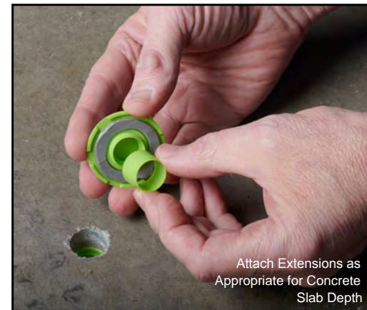
Attach Extensions as Appropriate for Concrete Slab Depth

Caution: NEVER use your Total Reader® device to install the L6 Smart Sensor.