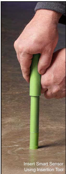
Insert Smart Sensor Using Insertion Tool

TIP: Check the L6 Smart Sensor prior to installation to ensure there is a properly functioning sensor that is giving a reading.